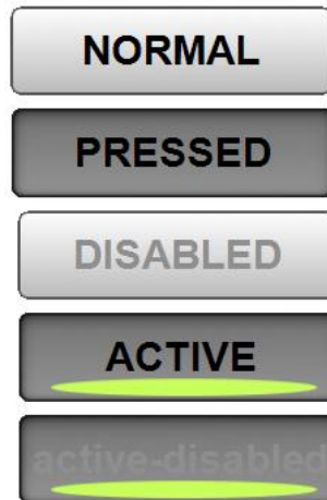
Screenshot with example buttons with various states.